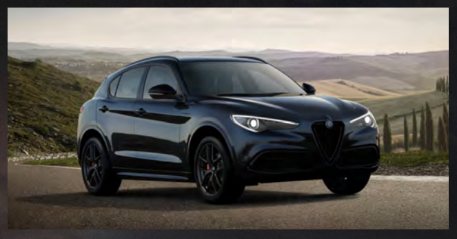
408 Vulcano Black Option