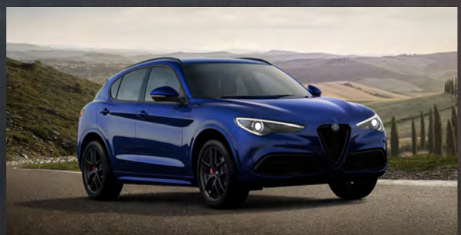
486 Anodized Blue Option