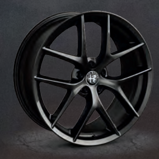
3EF - Veloce Dark Alloy Wheel (Standard)