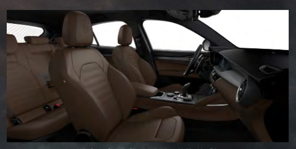
467 - Sports Seats in Chocolate Leather with Matching Trim (Customer Order Only)