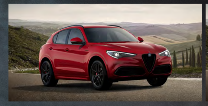
414 Alfa Red Standard