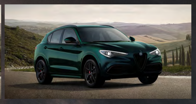
800 Visconti Green Option