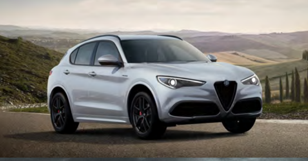
252 Perla Moonlight Option