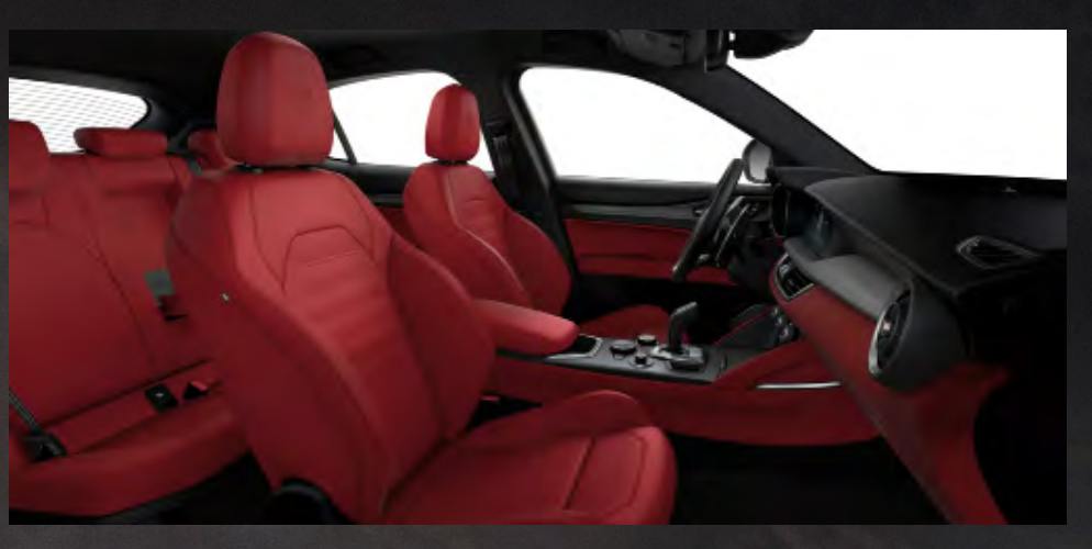
422 - Sports Seats in Red Leather with Matching Trim (Option on Veloce)