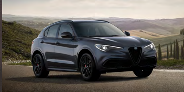
035 Vesuvio Grey Option