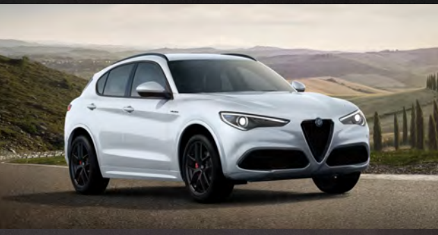
217 Alfa White Standard