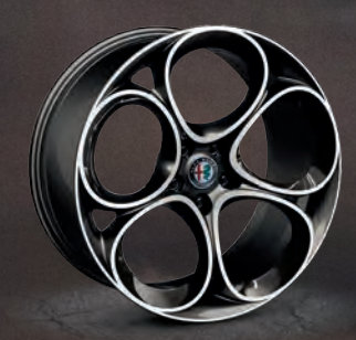
3EH 20" Veloce Sport Alloy Wheel (Option)