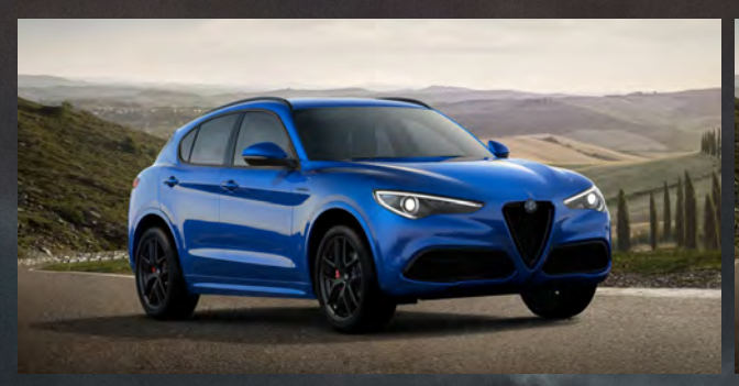
756 Misano Blue Option