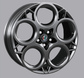
1M4 – Veloce (Option)