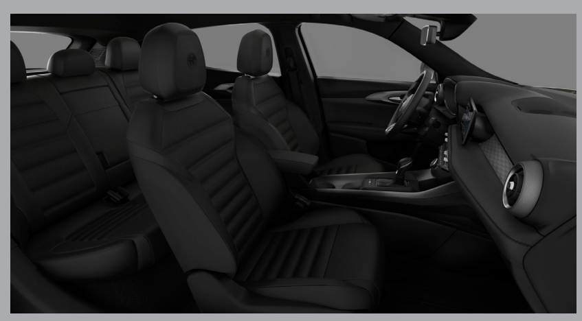
428 - Perforated Black Leather-Accented Seats with Embroided Alfa Romeo Logo and Dark Grey Double Stitching (Option on Ti)