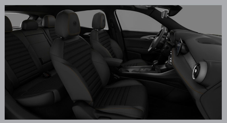
047 - Carbon Cloth and Leatherette Seats with Electro-welded Alfa Romeo Logo and Biscotto Stitching (Standard on Ti)