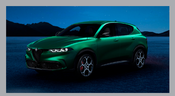
Montreal Green Tri-Coat (6FW)