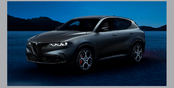
Vesuvio Grey Metallic (3XV)