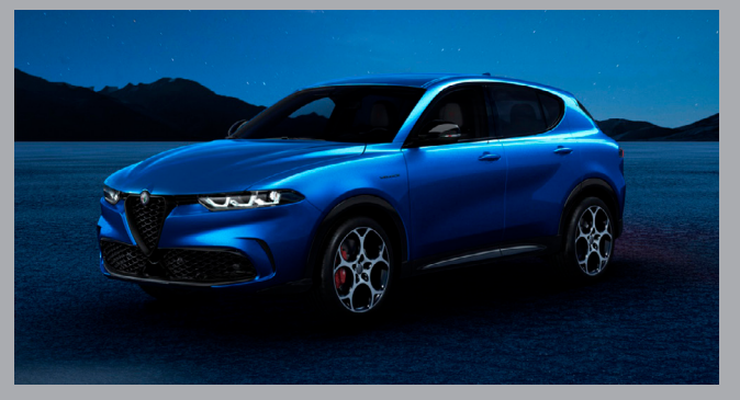
Misano Blue Metallic (3YS)