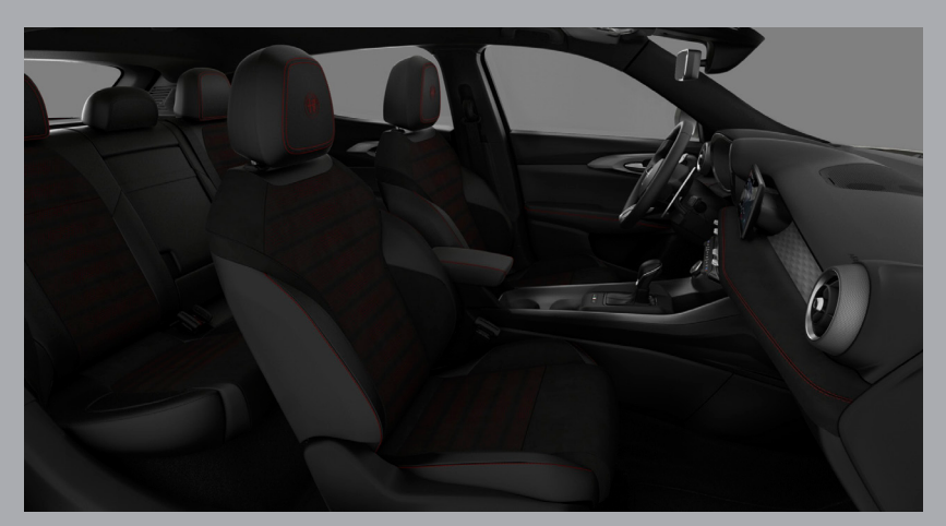
783 - Perforated Black Alcantara and Leatherette Seats with Embroided Alfa Romeo Logo and Red Stitching (Standard on Veloce)